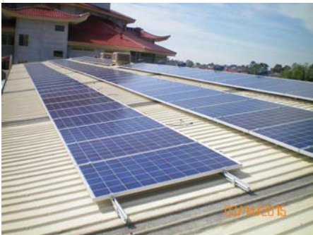
40kWp SOLAR PANELS