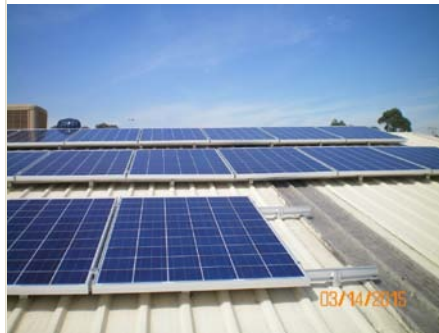
ARRAYS OF SOLAR PANELS CLOSE-UP